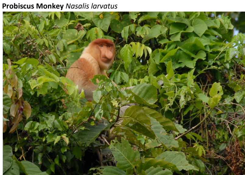
Proboscis Monkey Nasalis larvatus