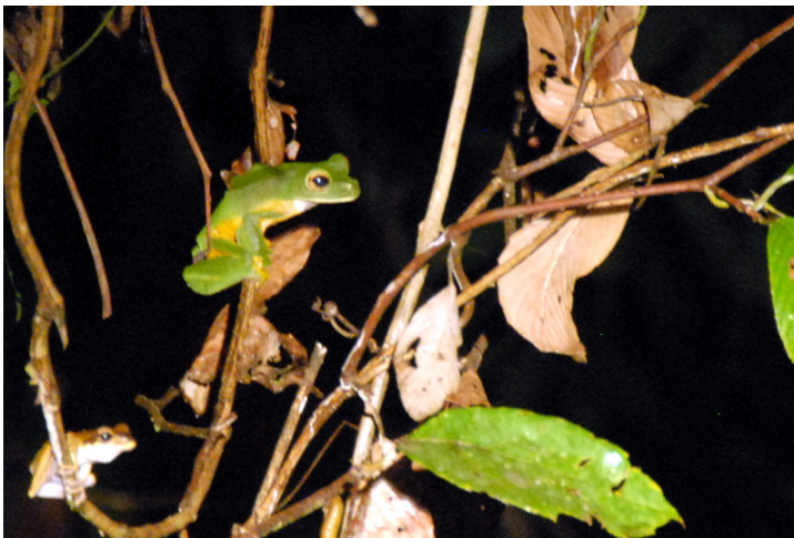
Harlequin Flying Frog Rhacophorus pardalis