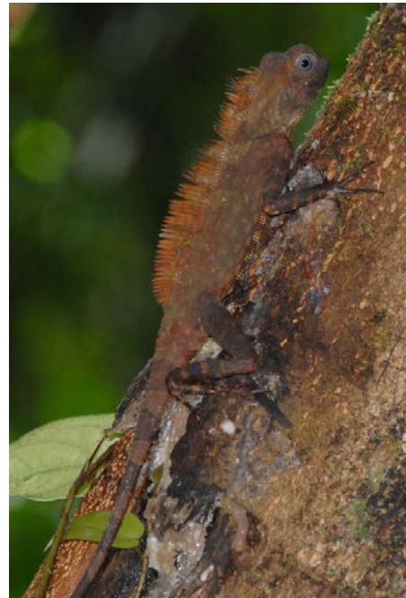
Comb-crested Agamid Gonocephalus liagastur